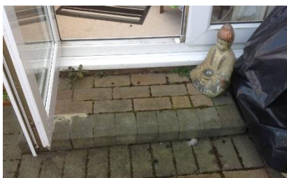
Step(s) or threshold close-up photos

C – Take some close-up and stand-back photographs of the steps/threshold and surrounding area